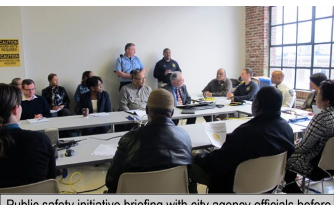
Public safety initiative briefing with city agency officials before door-knocking event.

process and regularly trains the Baltimore Police Department on scanning procedures for secure identification cards and business access to specified restricted areas for employees with critical roles and responsibilities. Currently, a couple hundred businesses in the city are registered, but MOEM plans to expand the program regionally or statewide through the Maryland Emergency Management Agency