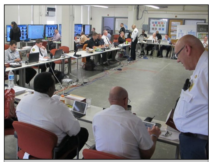
Unified command center during Preakness 2014.

UMMC is part of several different working groups, including: the Region III Consortium Workgroup, which deals with the Medical Task Force; as well as a hospital consortium, which includes participation from