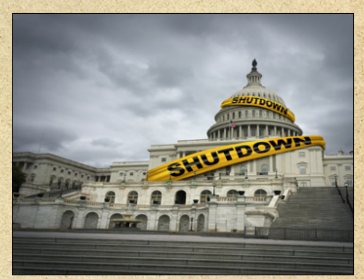
Government Shutdowns: Emergencies, Disasters, or Expected Events By Kay C. Goss