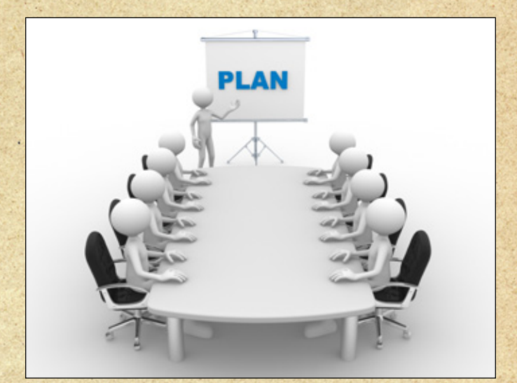
Integrating Jurisdiction Plans By Allen B. King III